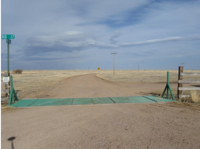
WCR 118 EAST

PAD LOCATION NW ¼ NW ¼ SECTION 16 T10N R67W WELD COUNTY COLORADO