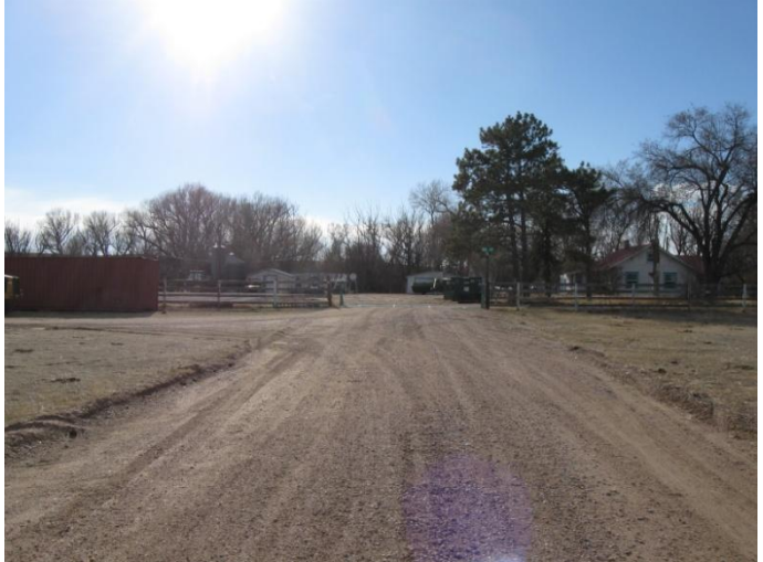
WCR 118 WEST