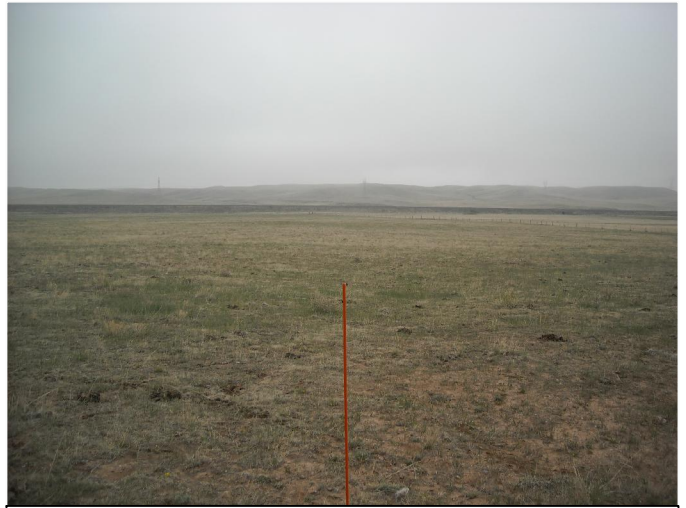
PAD LOCATION FACING EAST