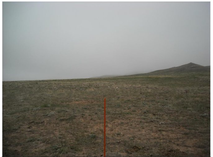
PAD LOCATION FACING WEST