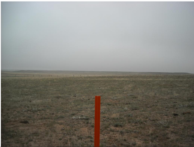
PAD LOCATION FACING SOUTH