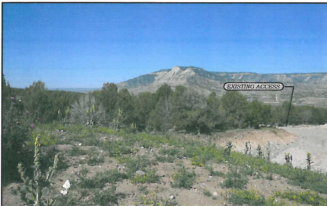
PHOTO: VIEW FROM SE CORNER OF EXISTING PAD

PA 541-9, PA 344-4, PA 44-4, PA 343-4, PA 443-4, PA 434-4, PA 33-4, PA 333-4, PA 544-4, PA 31-9, PA 331-9, PA 431-9, PA 334-4