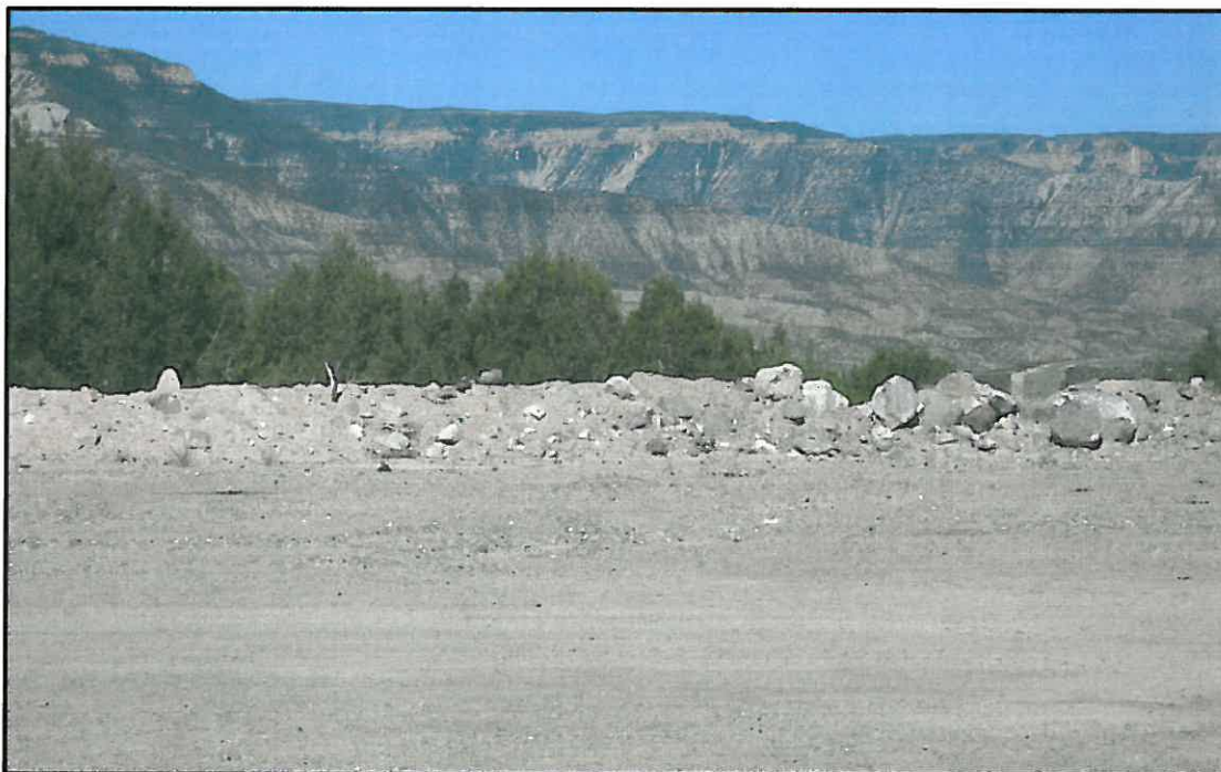
PHOTO: VIEW FROM PAD CENTER