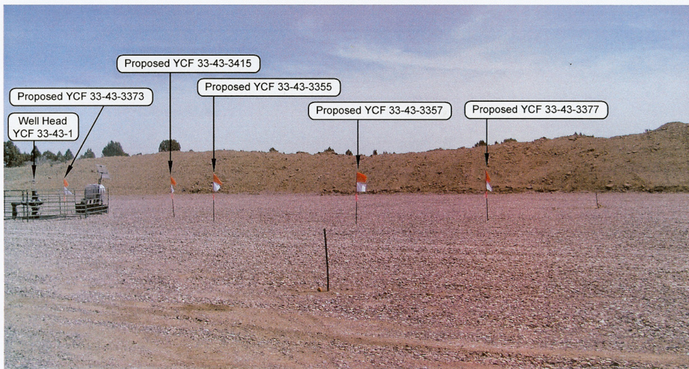
PHOTO LOCATION: LATITUDE LONGITUDE NAD 83: (40° 00' 38.84"N) (108° 23' 25.01"W)