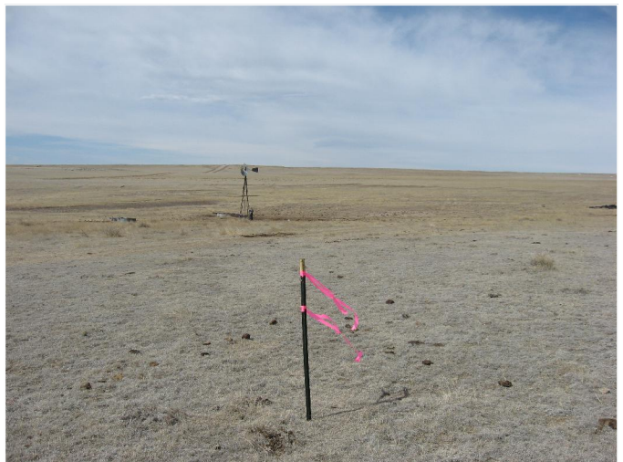
PAD LOCATION FACING WEST