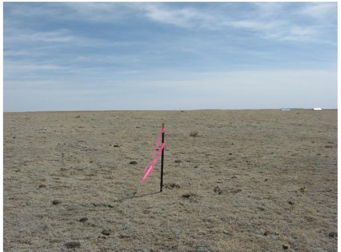
PAD LOCATION FACING EAST