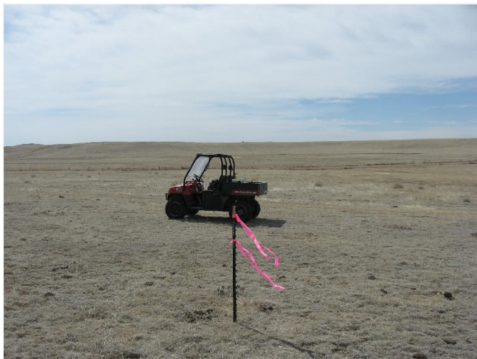
PAD LOCATION FACING SOUTH