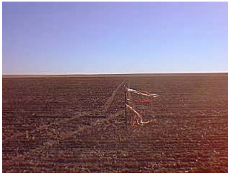
Franson 844-10-44 SE ¼ SE ¼ SEC. 10, T8N, R44W Looking South 03 November, 2009