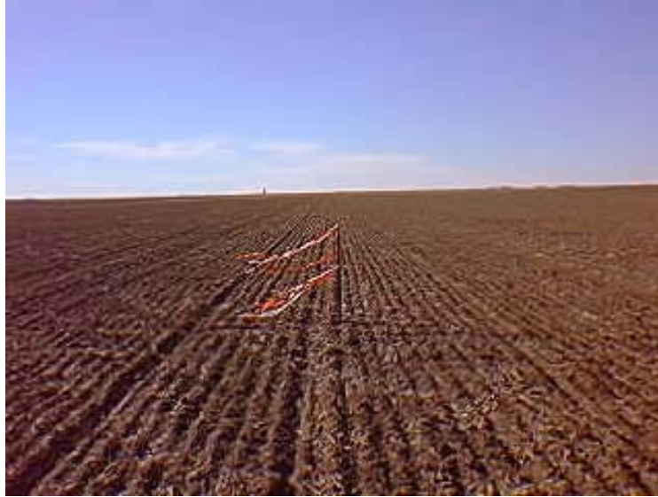
Franson 844-10-44 SE ¼ SE ¼ SEC. 10, T8N, R44W Looking West 03 November, 2009