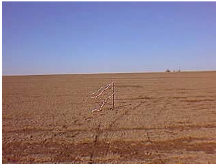
Franson 844-10-44 SE ¼ SE ¼ SEC. 10, T8N, R44W Looking North 03 November, 2009