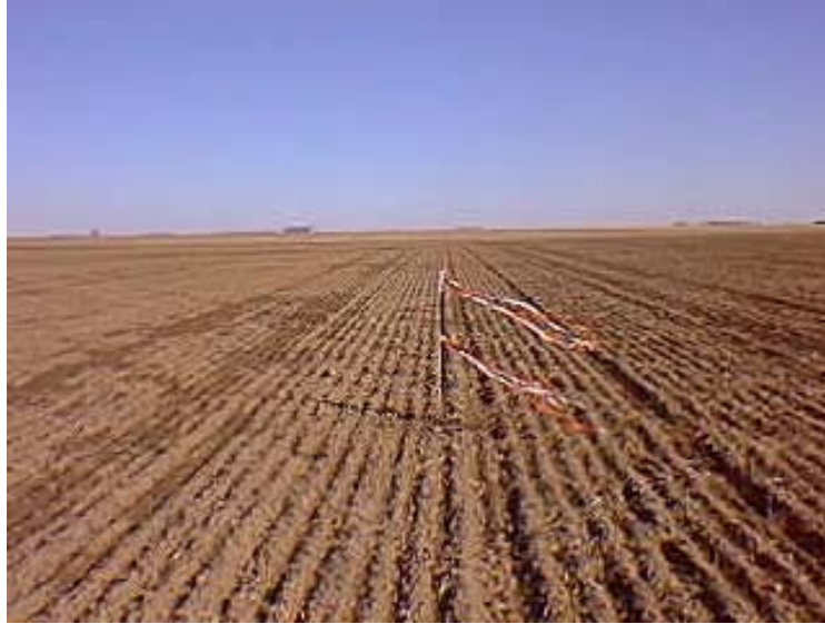
Franson 844-10-44 SE ¼ SE ¼ SEC. 10, T8N, R44W Looking East 03 November, 2009