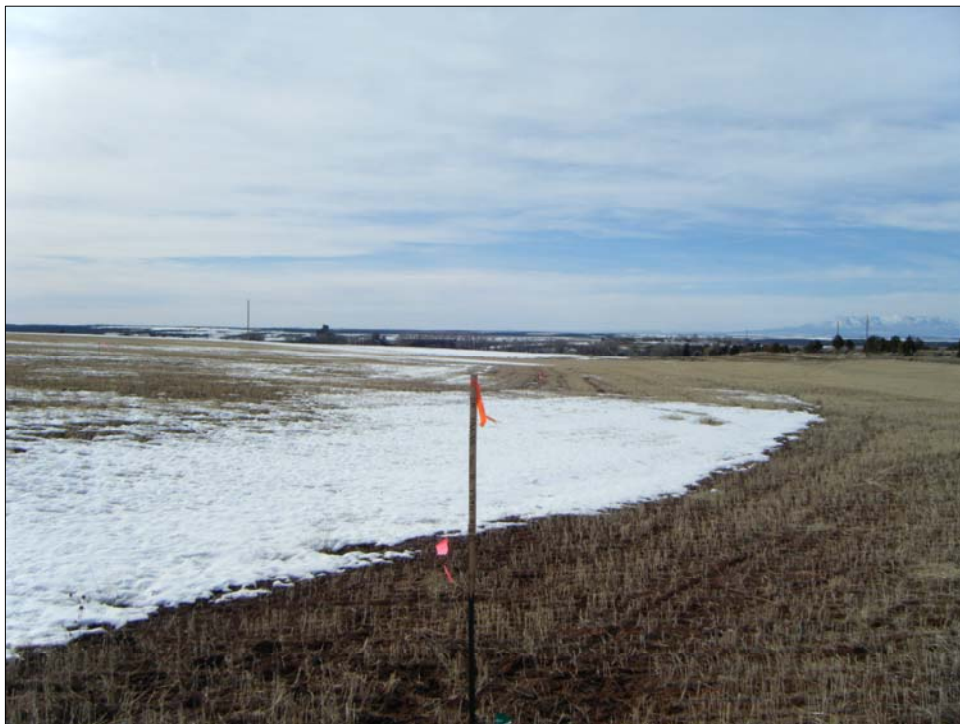
VIEW OF CENTER STAKE LOOKING WEST (2/05/09)