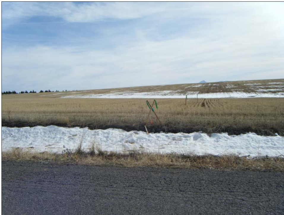
VIEW FROM BEGINNING OF ACCESS ROAD LOOKING SOUTH (2/05/09)