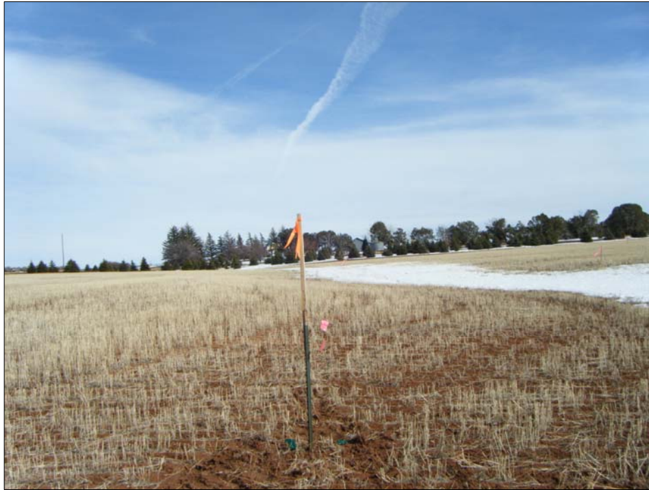
VIEW OF CENTER STAKE LOOKING NORTHEASTERLY (2/05/09)