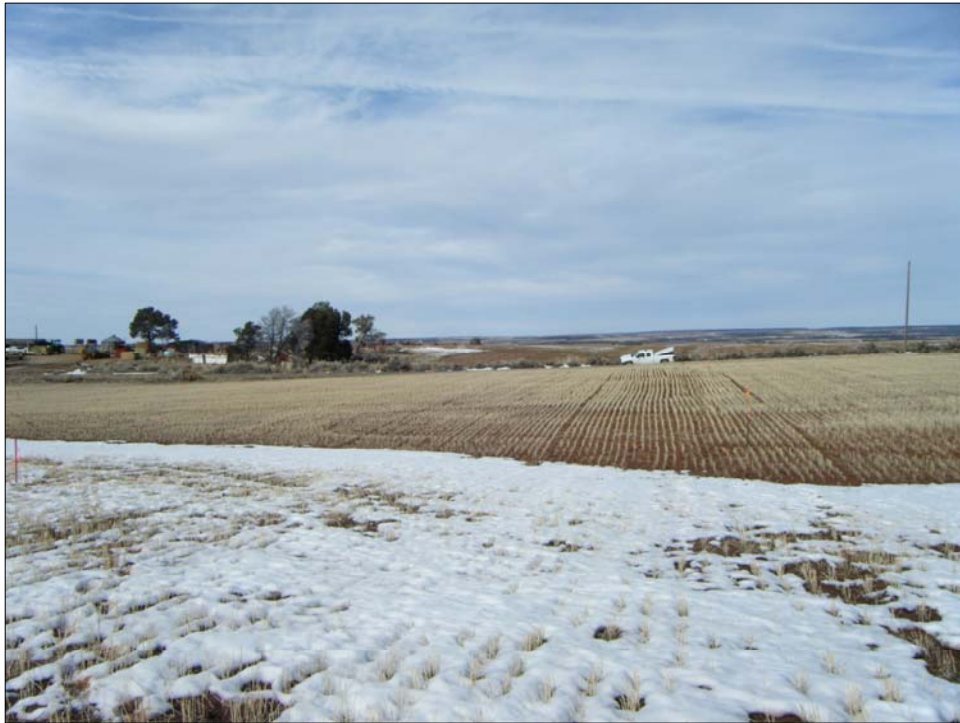
VIEW OF CENTER STAKE LOOKING NORTH (2/05/09)