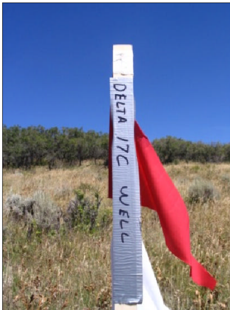
WELL FLAG Date Taken: 9/11/08