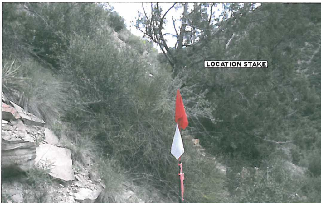
PHOTO: VIEW OF PROPOSED LOCATION STAKE