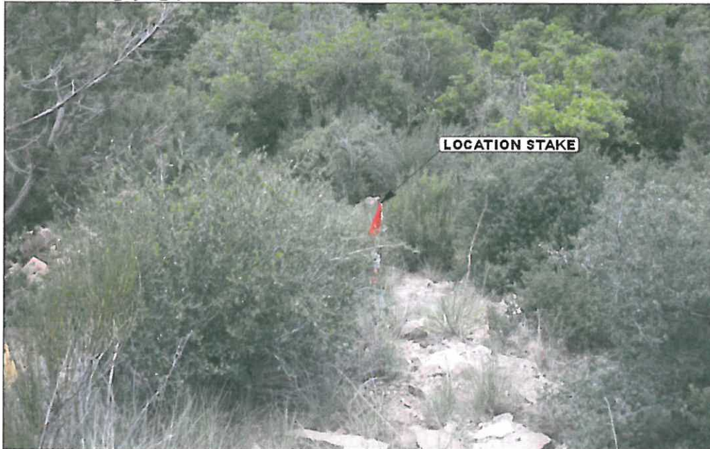
PHOTO: VIEW OF PROPOSED LOCATION STAKE