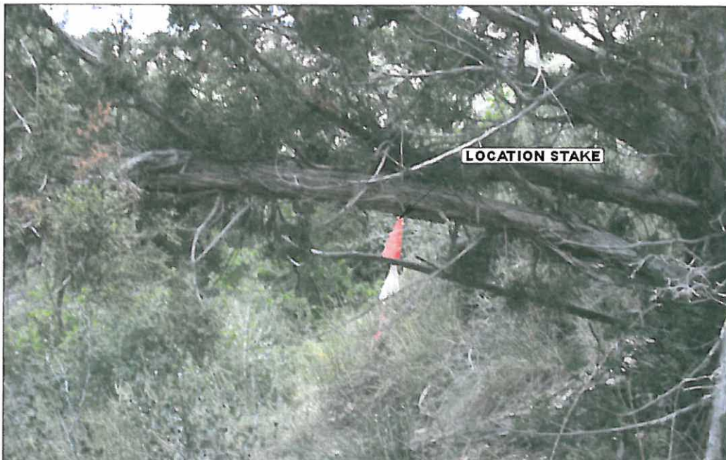
PHOTO: VIEW OF PROPOSED LOCATION STAKE