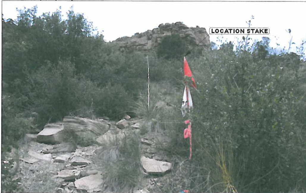
PHOTO: VIEW OF PROPOSED LOCATION STAKE