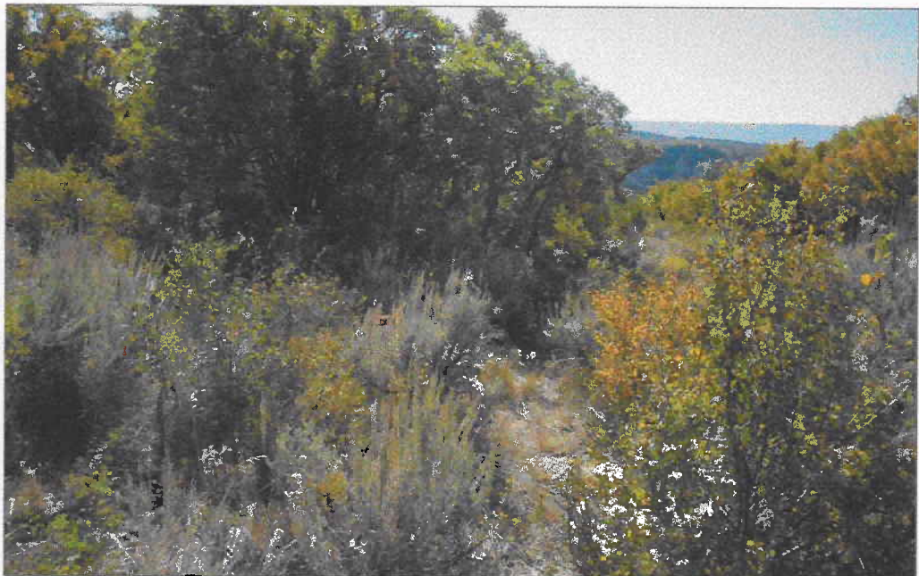
PHOTO: REFERENCE AREA VIEW

LOCATED IN GARFIELD COUNTY, COLORADO SECTION 21, T6S, R97W, 6th P.M. NE 1/4 SE 1/4