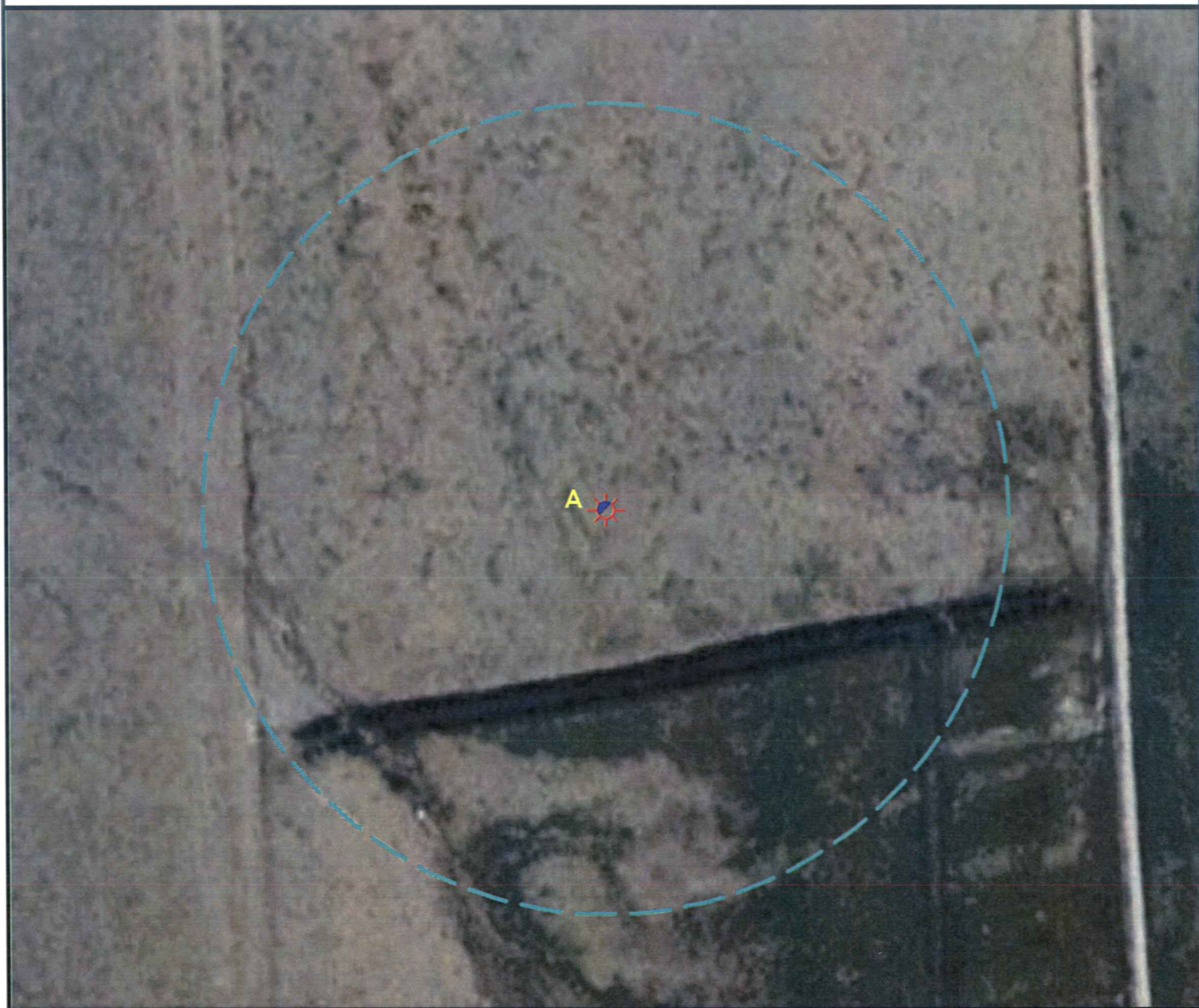
A. Proposed Well DETERDING 31-10.

There are no visible improvements within a 400' radius of proposed oil & gas location.