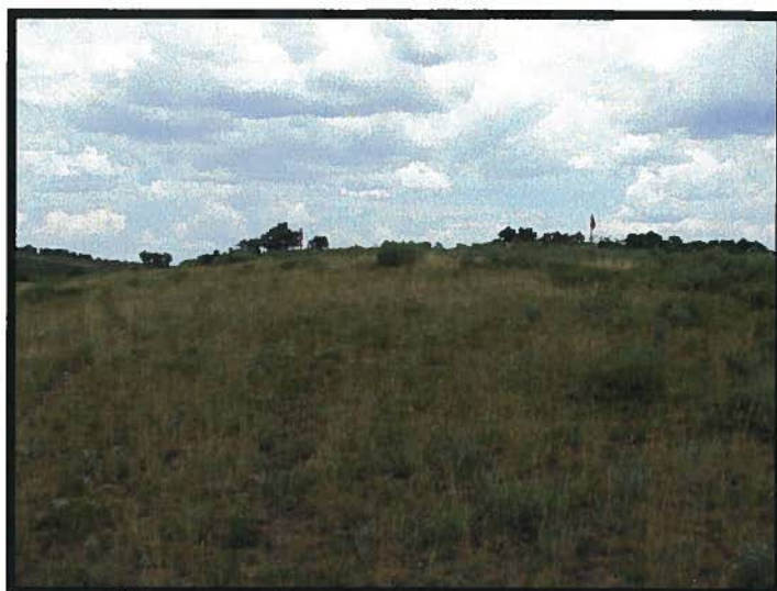
E CORNER OF PAD LOOKING WESTERLY