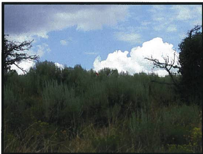
N CORNER OF PAD LOOKING SOUTHERLY