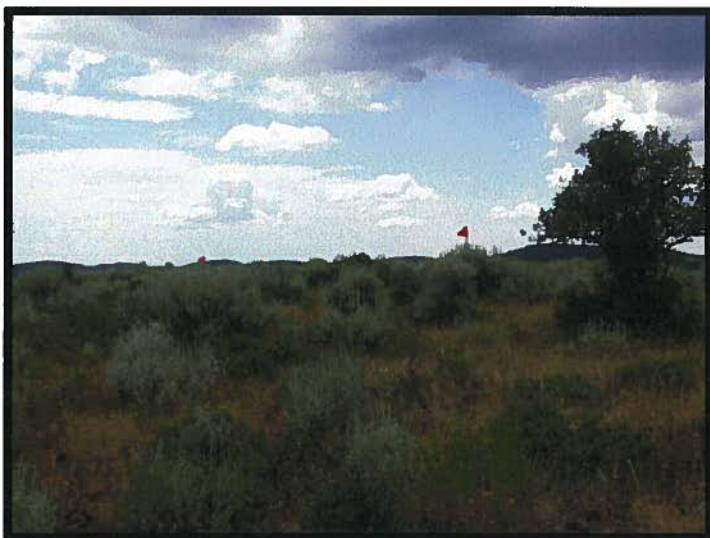
W CORNER OF PAD LOOKING EASTERLY