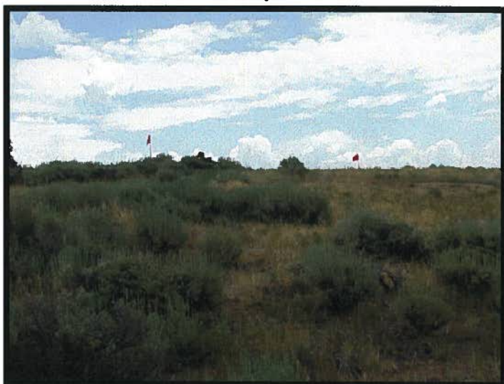
S CORNER OF PAD LOOKING NORTHERLY