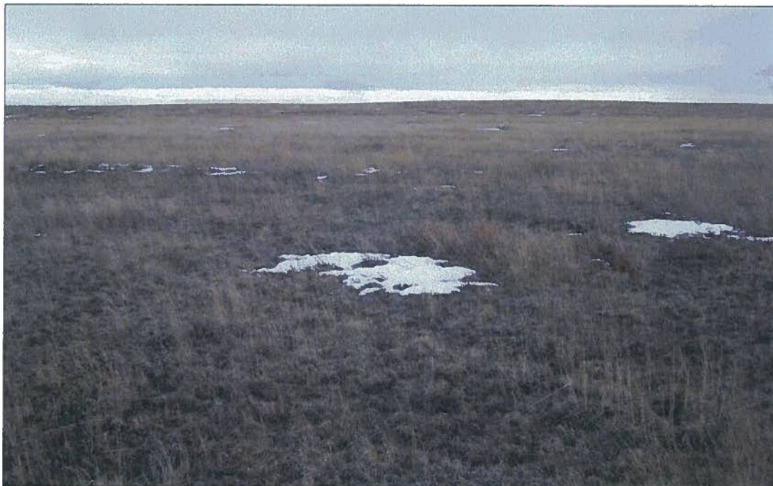
PHOTO: VIEW OF REFERENCE AREA