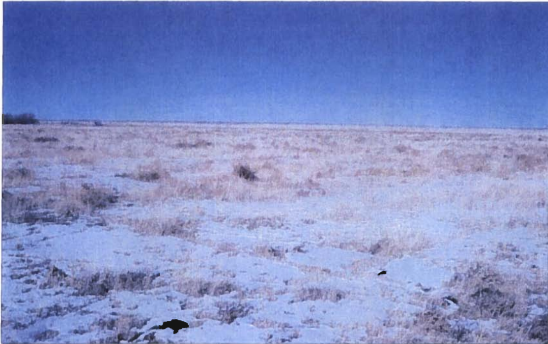
PHOTO: VIEW OF REFERENCE AREA