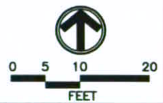
FIGURE 1 MONITORING WELL LOCATION MAP STRONG 1, P21-2, 7, 8, 9, 10J, 16, 1JI, 2JI, 7JI TANK BATTERY WELD COUNTY, COLORADO NOBLE ENERGY, INC.