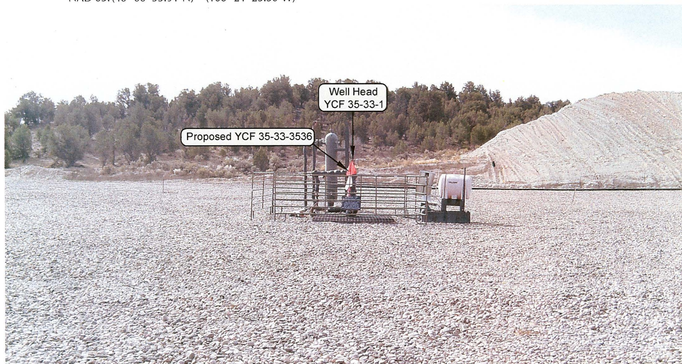
PHOTO LOCATION: LATITUDE LONGITUDE NAD 83: (40° 00' 35.37"N) (108° 21' 23.41"W)