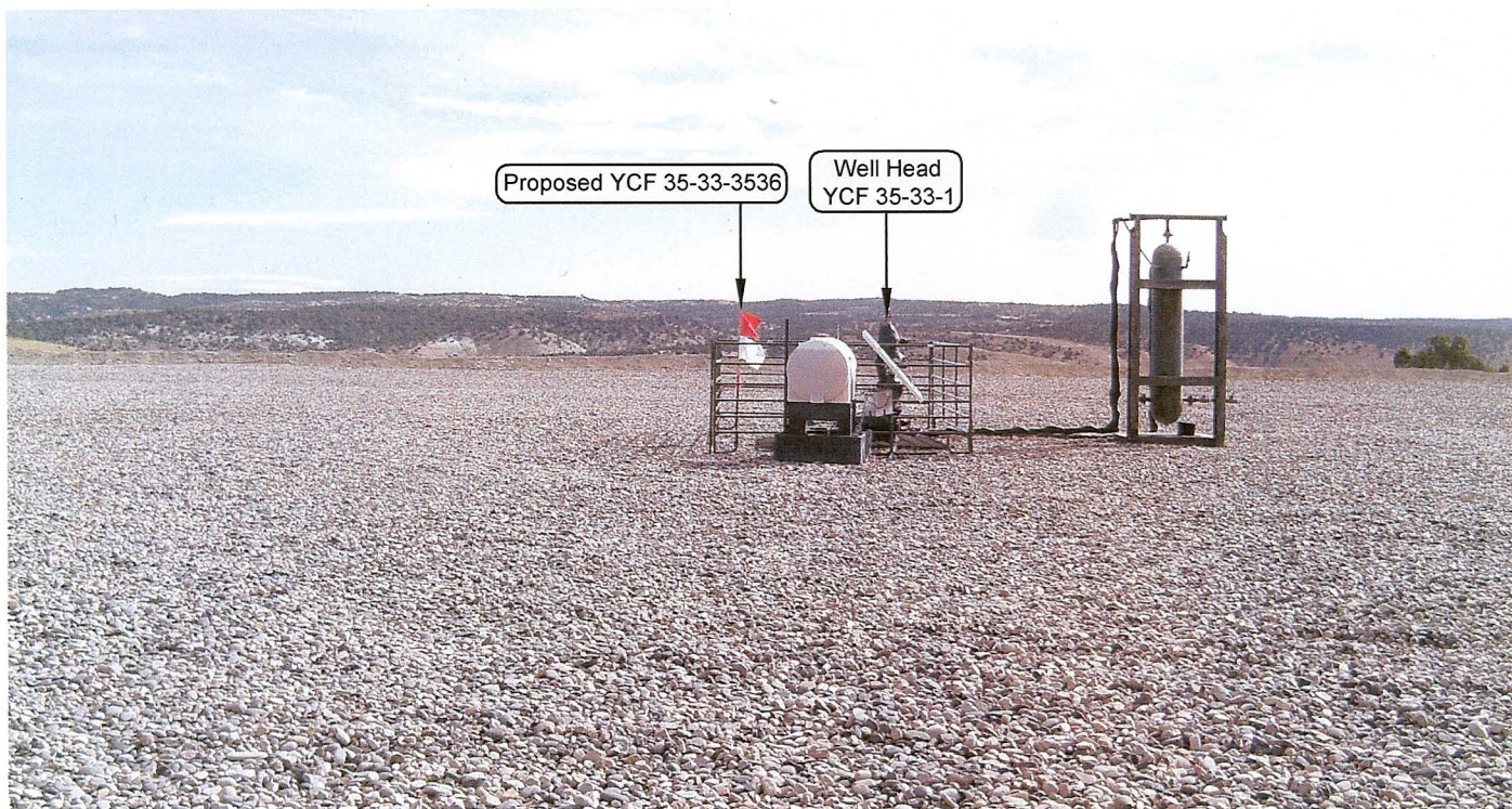
PHOTO LOCATION: LATITUDE LONGITUDE NAD 83: (40° 00' 34.60"N) (108° 21' 24.53"W)