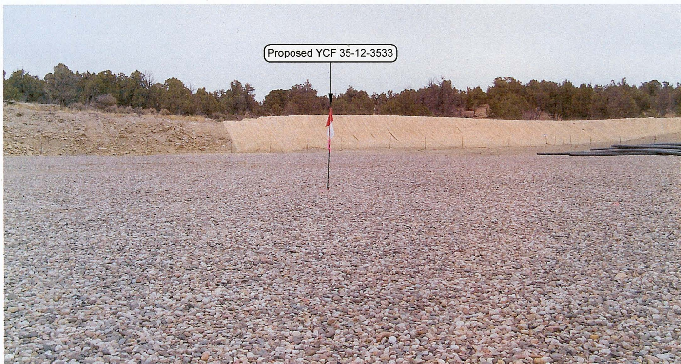
PHOTO LOCATION: LATITUDE LONGITUDE NAD 83: (40° 00' 49.16"N) (108° 21' 55.73"W)