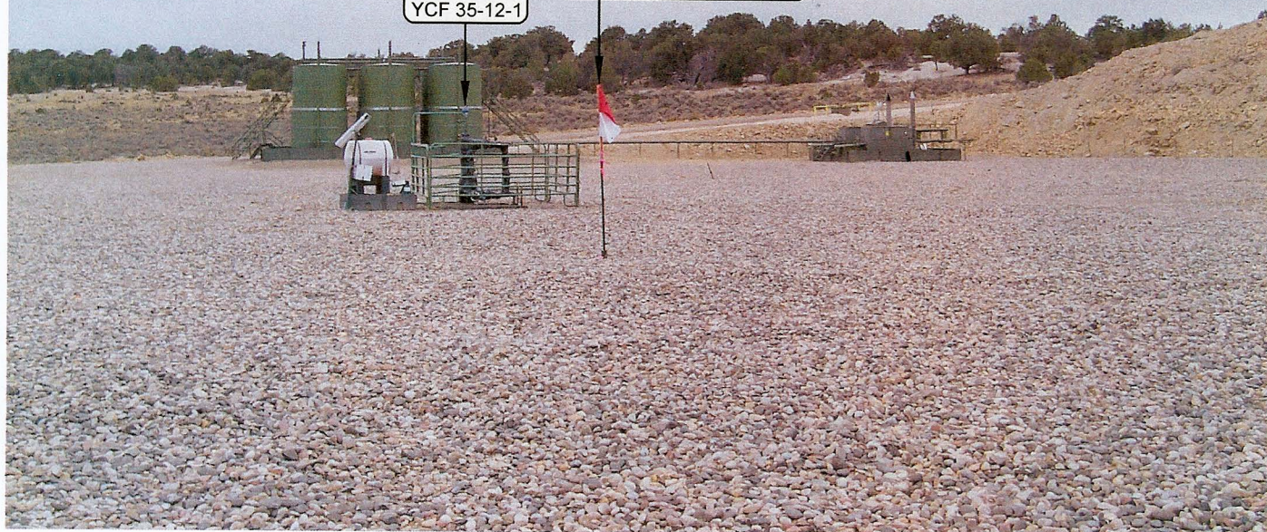
PHOTO LOCATION: LATITUDE LONGITUDE NAD 83: (40° 00' 49.84"N) (108° 21' 54.95"W)