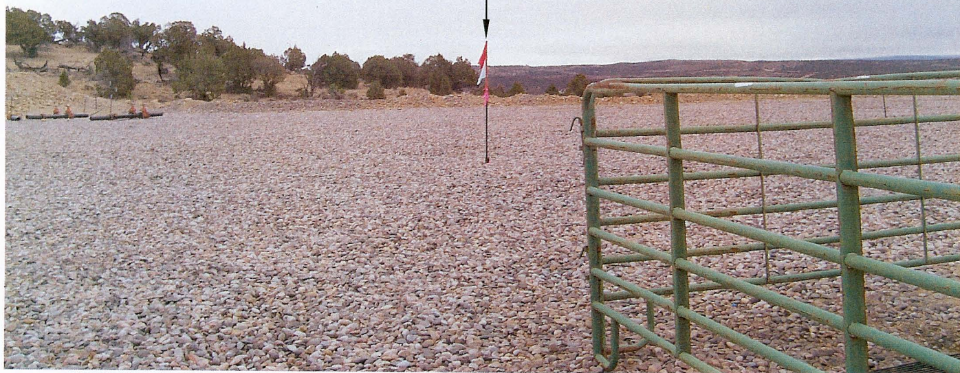
PHOTO LOCATION: LATITUDE LONGITUDE NAD 83: (40° 00' 49.84"N) (108° 21' 56.56"W)