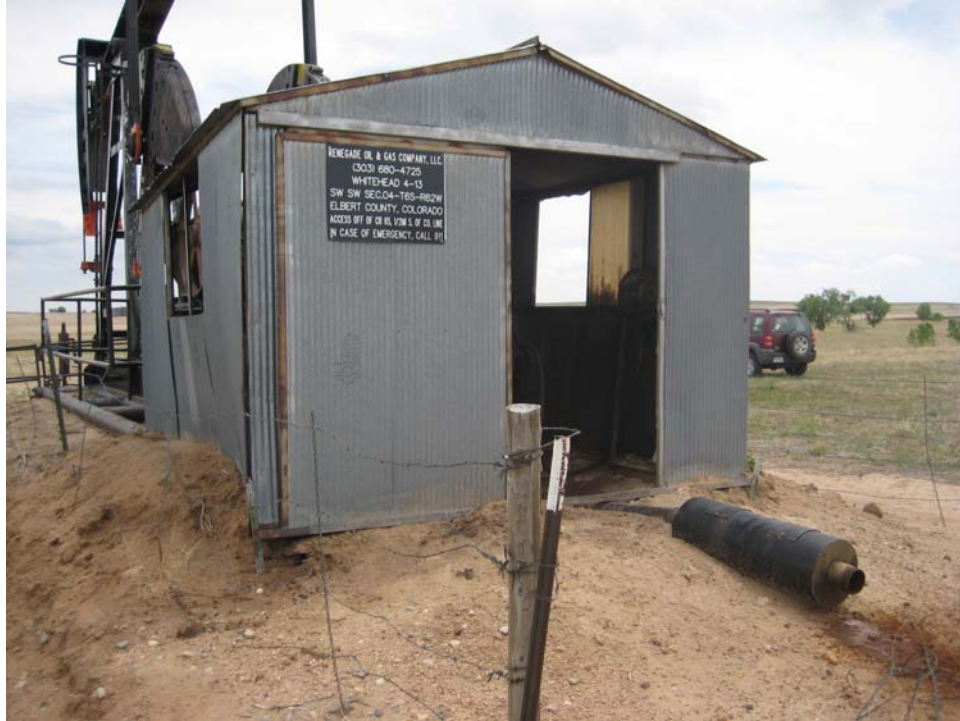
Photo 1. Whitehead 4-13 wellhead