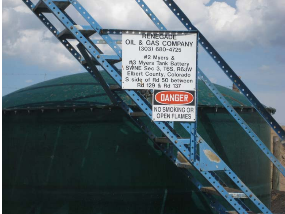
Photo 1. Covered fiberglass water tank and lease sign