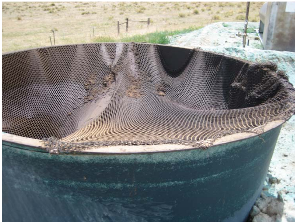
Photo 2. Covered fiberglass tank