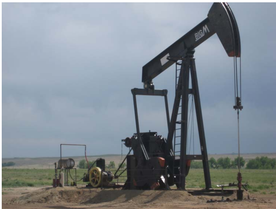
Photo 3. Myers 32-3 2 wellhead