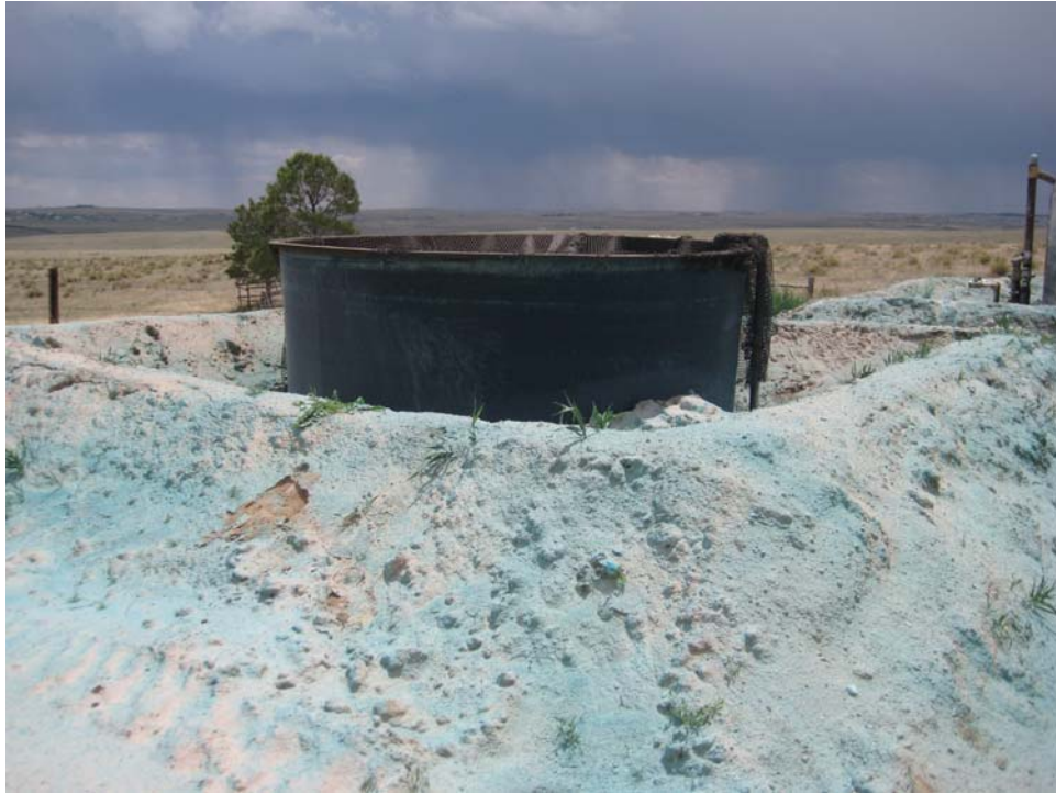
Photo 3. Fiberglass tank and berm