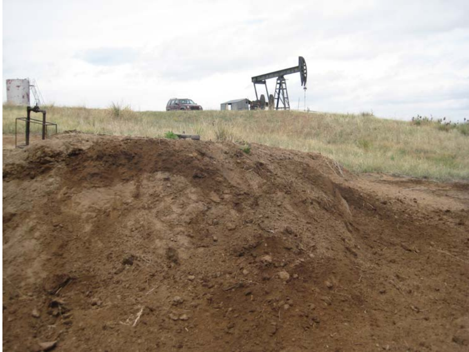
Photo 5. Looking northwest at buried concrete vault and wellpad