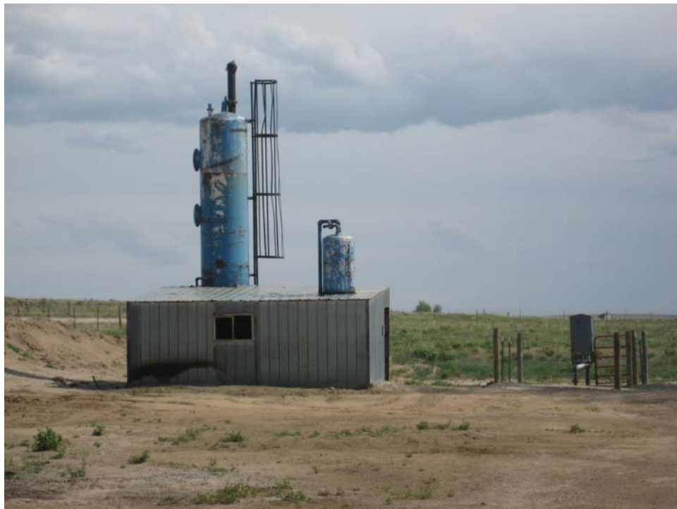
Photo 2. Separator on battery site for Myers 32-3 2