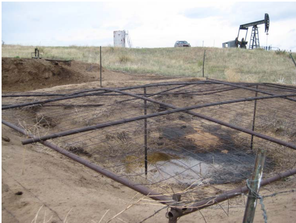
Photo 6. Earthen pit