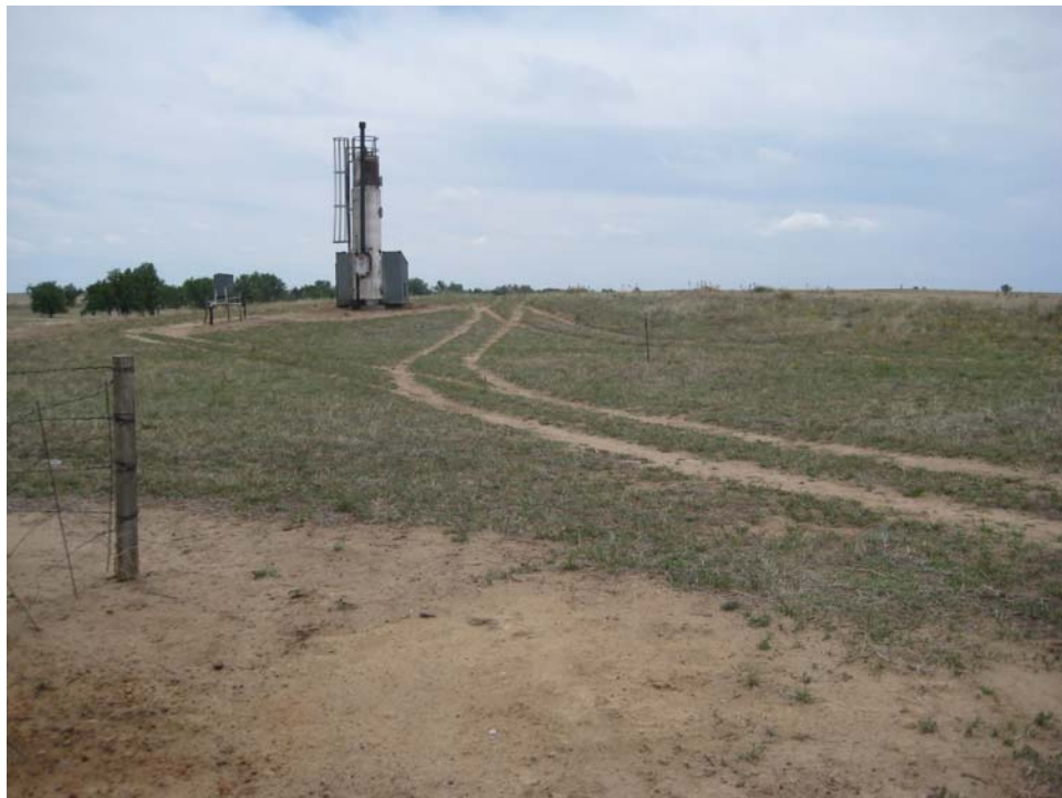
Photo 2. Looking south at vertical separator