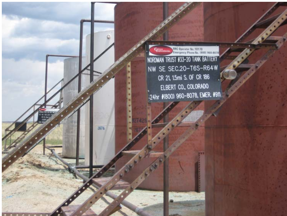
Photo 2. Battery tanks and lease signs