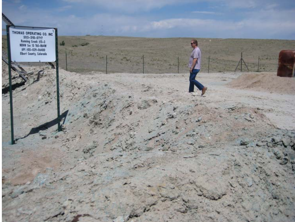
Photo 1. Lease sign for Running creek 15-3 and former pit site beyond berm