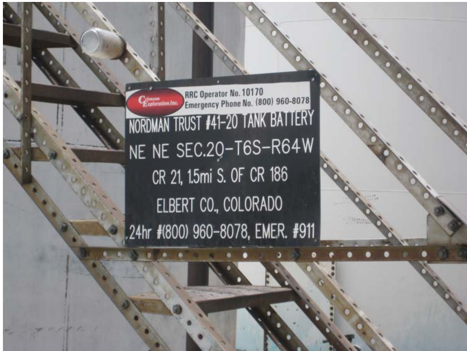
Photo 1. Battery tanks and lease signs; fiberglass tank is southeast of tanks