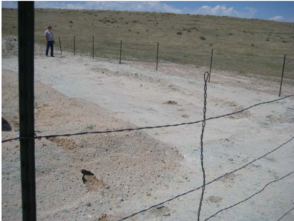
Photo 2. Looking southwest showing recently backfilled pit inside fence