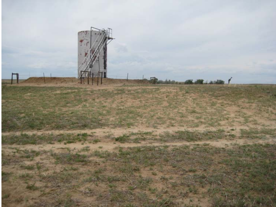
Photo 3. Looking southwest at 200 BBL tank