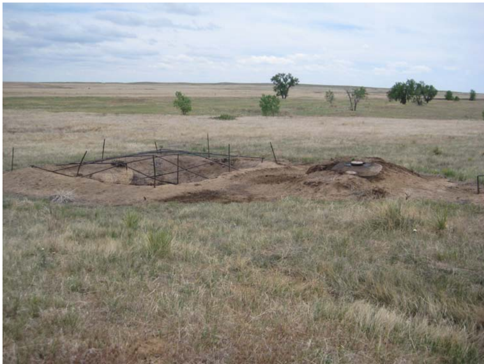
Photo 4. Covered earthen pit and concrete vault