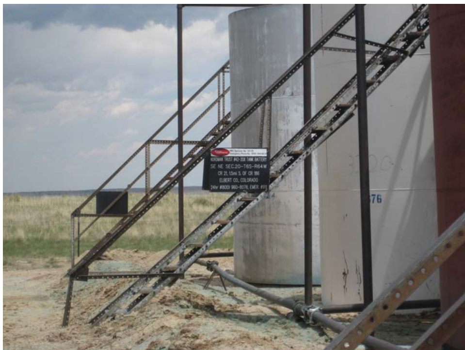
Photo 3. Battery tanks and lease signs