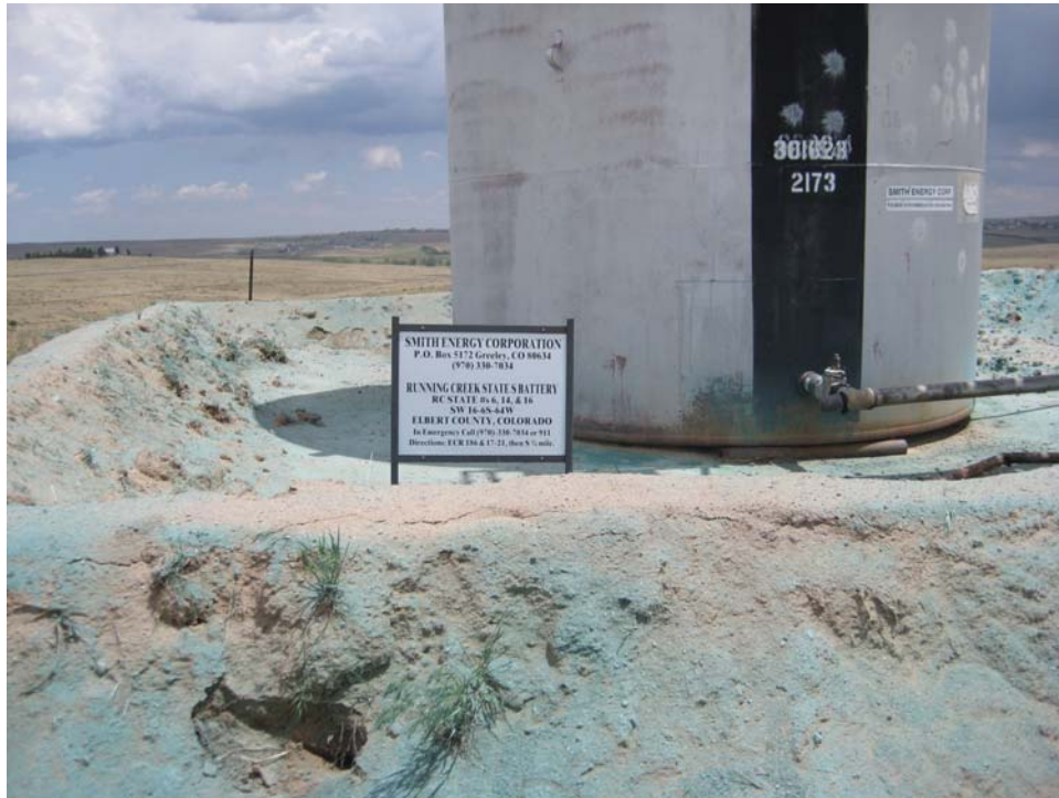
Photo 1. Tank battery sign