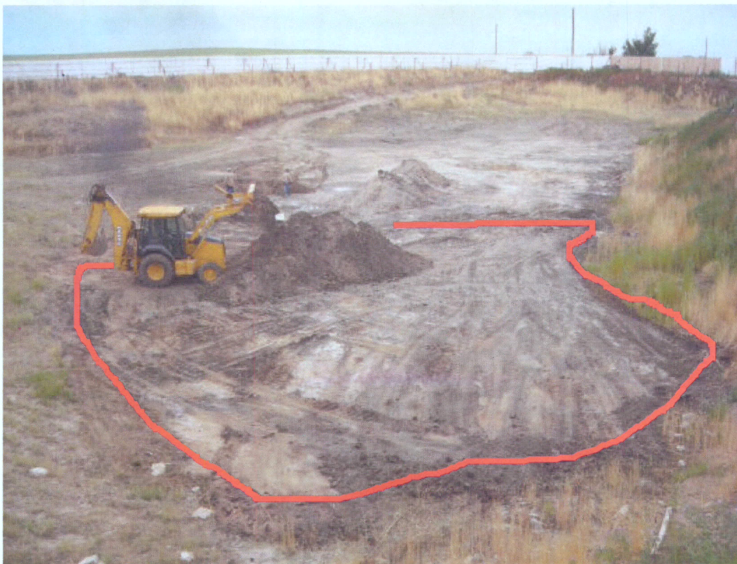
Photograph 3: Noble contractors removing drilling mud, view is north.