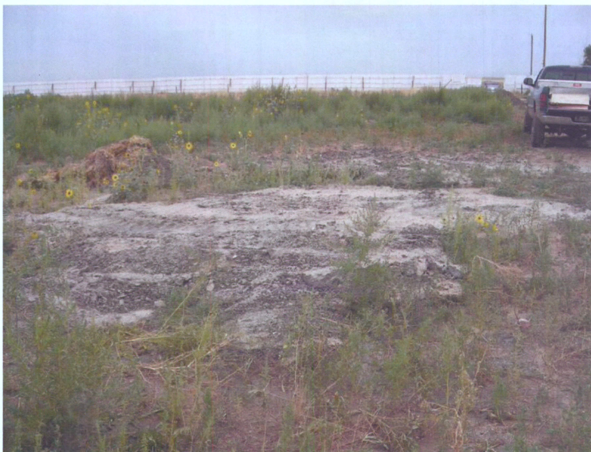
Photograph 7: Drilling mud applied by the property owner to the edge of the driveway, view is west.