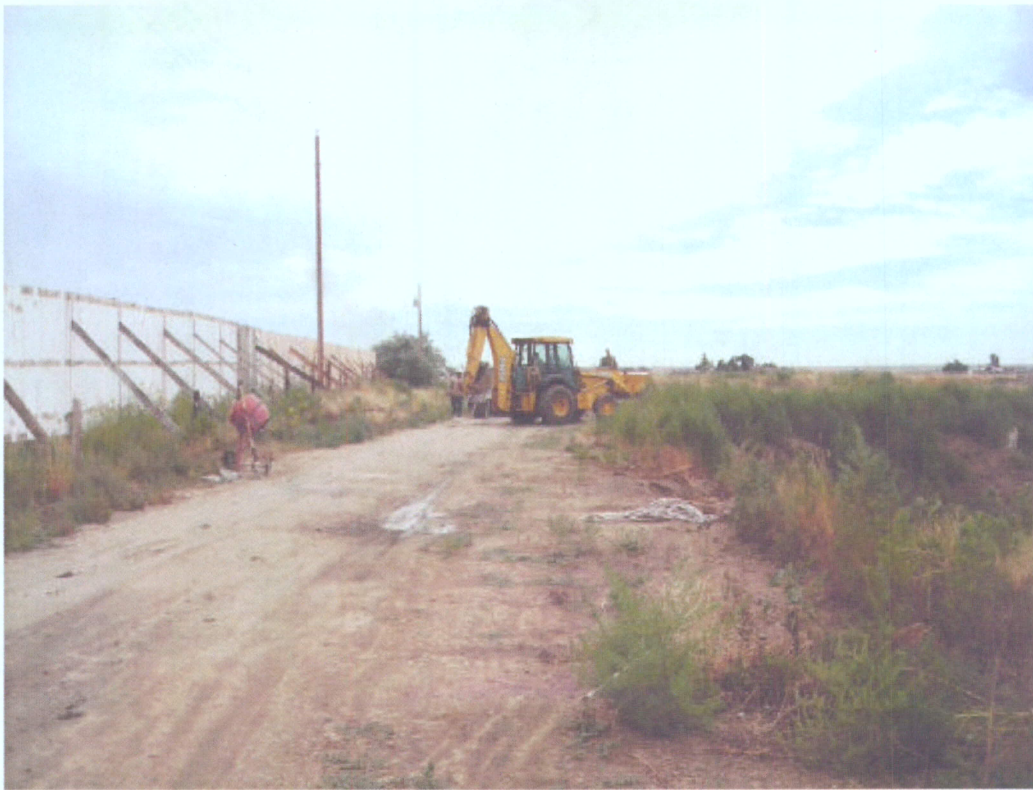
Photograph 5: Application of removed drilling mud along the driveway, view is east.