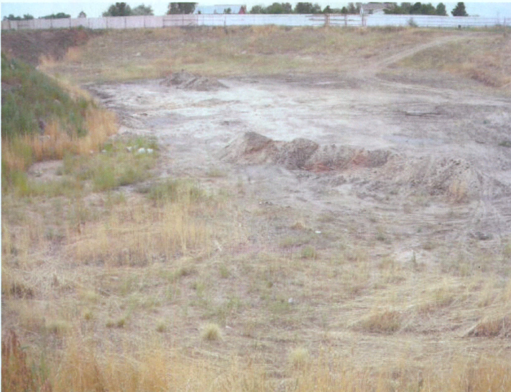
Photograph 1: Depression on Baros Property, view is south.