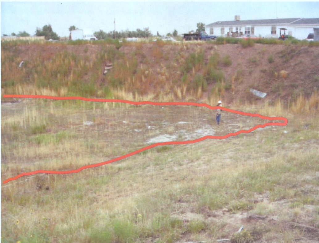
Photograph 2: View of drilling mud not removed by the property owner, view is east.