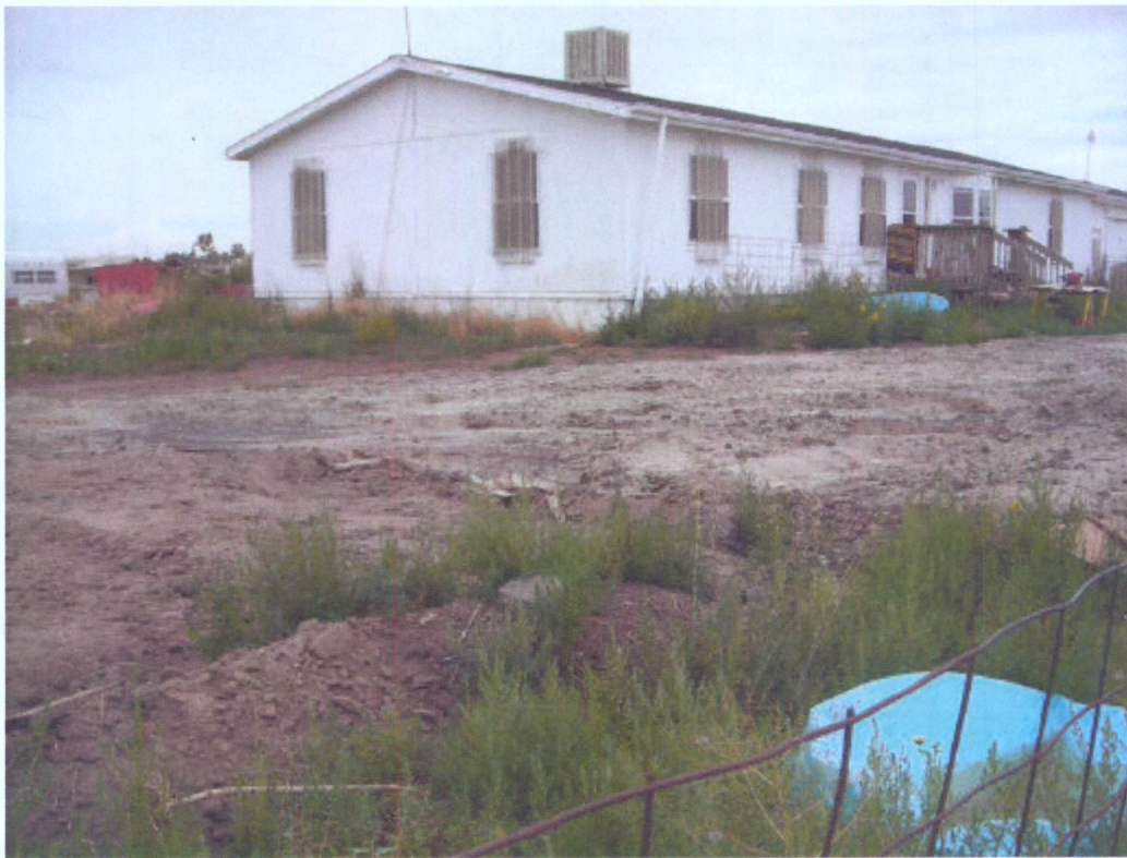
Photograph 6: Drilling mud applied by the property owner to the front yard, view is south east.