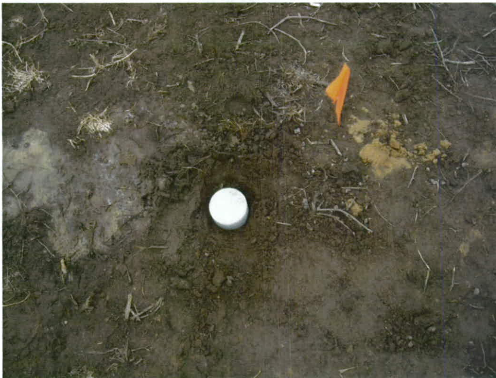
Photograph 2: View of test boring completion with protective cap.