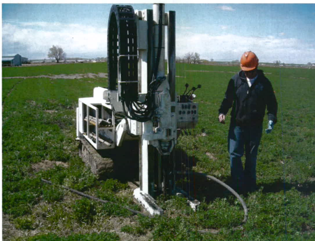
Photograph 6: Close up view of injection rig.