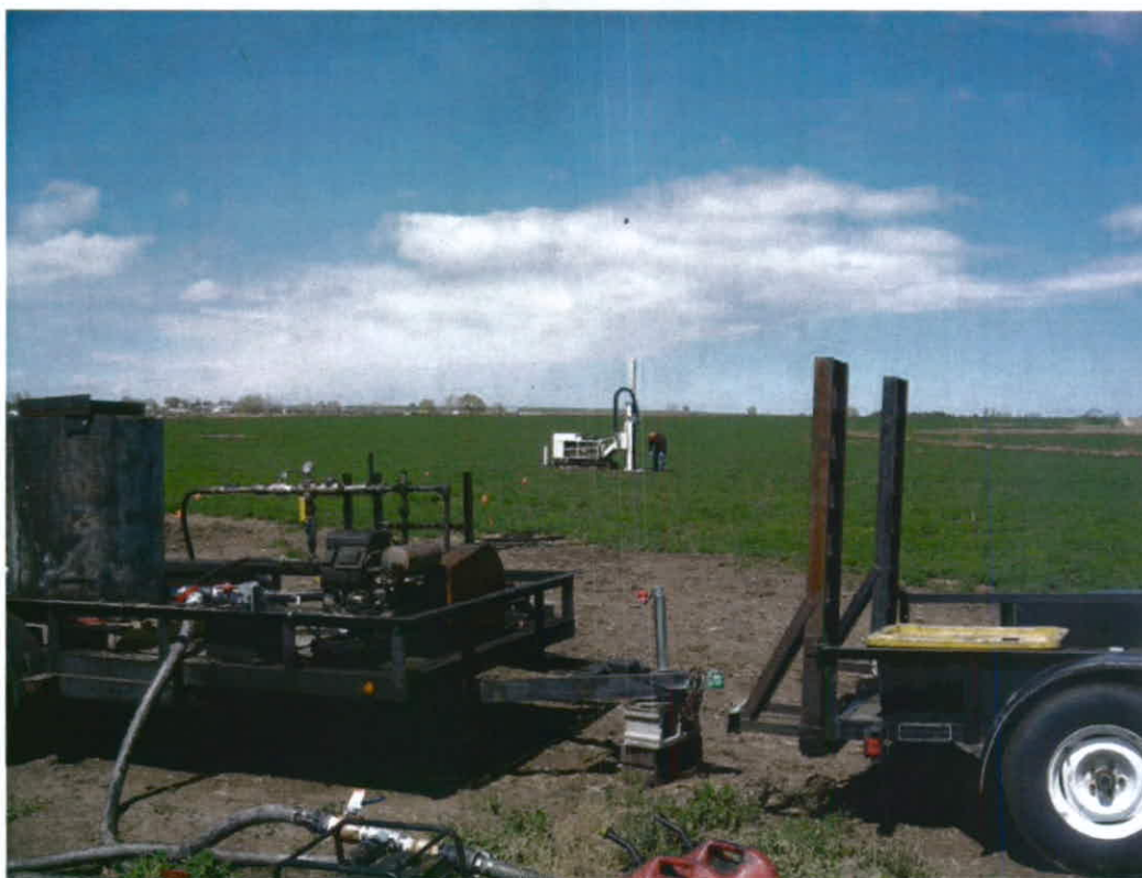
Photograph 5: Injecting carbon slurry into the groundwater plume.