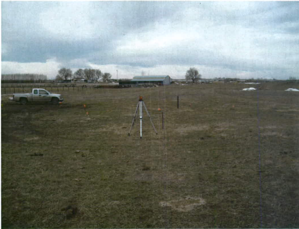
Photograph 1: Test borings (orange flags) and existing wells (black stakes), view is west.