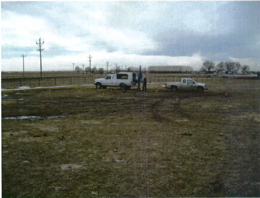
Photograph 3: Test boring installation, view is west.