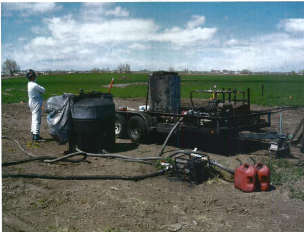
Photograph 4: Injection trailer setup. Trailer is on top of previous excavation. View is northwest.