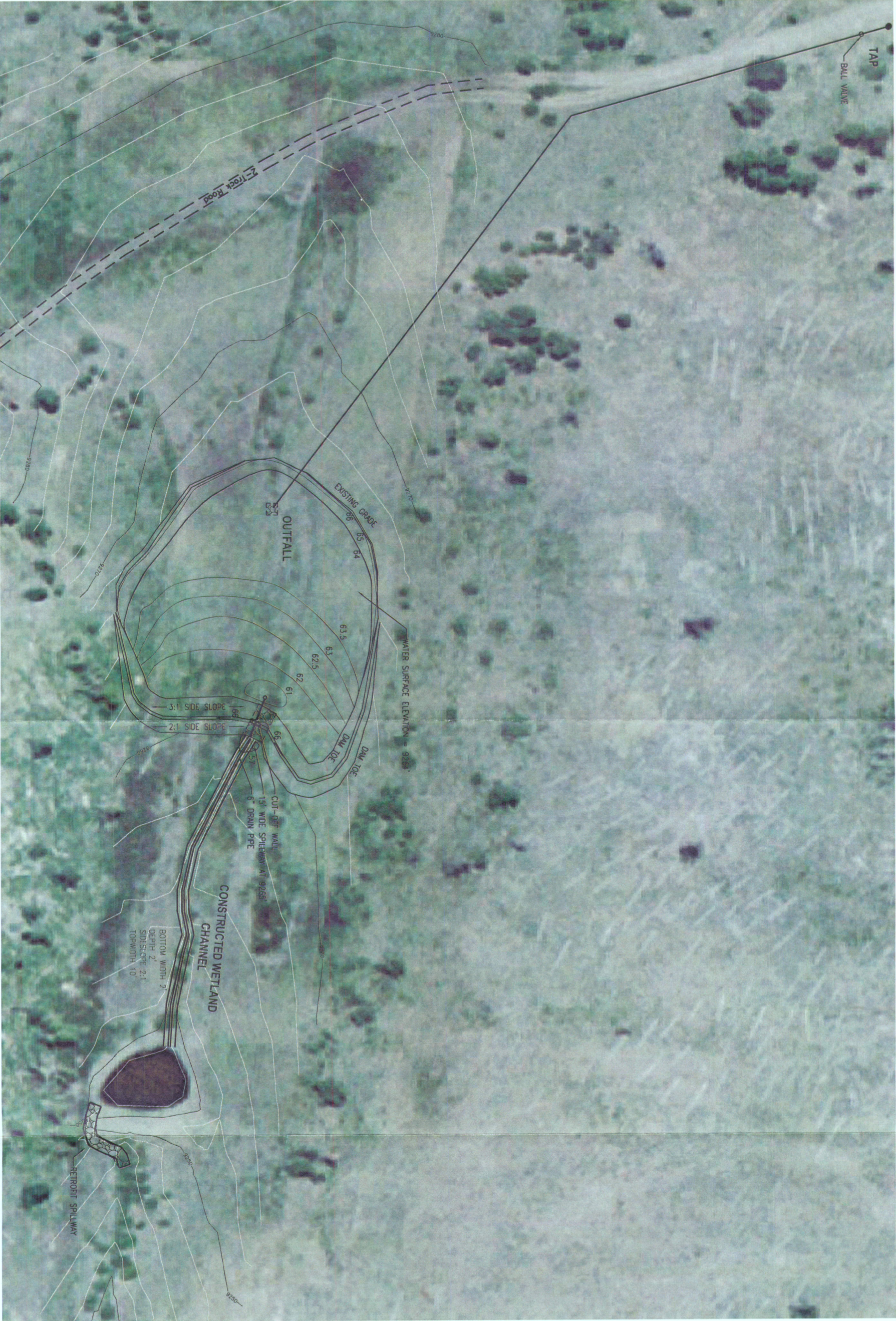
GRADING PLAN - WETLAND A

SHEET NO., LG101 © EDRAW INC. ALL RIGHTS RESERVED